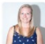
Olivia Hills Residential Care SMH leader